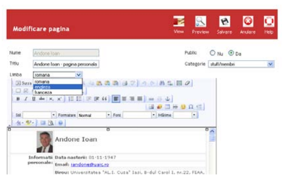
Fig.6. Multilingual content

The content must be managed in several languages. If international text and character sets are used, we must consider Unicode (http://www.unicode.org) as the best choice. WCM system store copies of a page in multiple languages as we can see in the next figure (Figure 6).