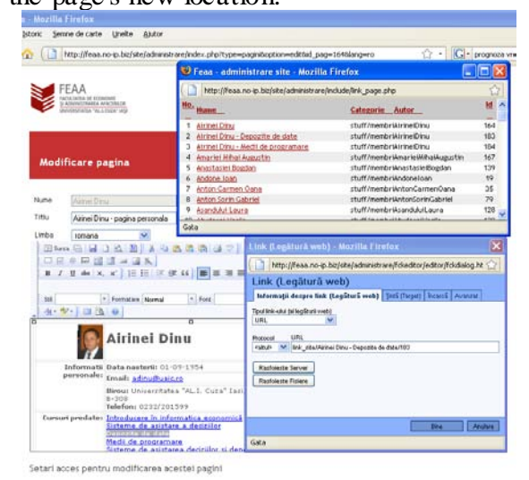
Fig.3. Link management

In this way, when a page is moved to a new location, the link can be regenerated based on the page's new location.