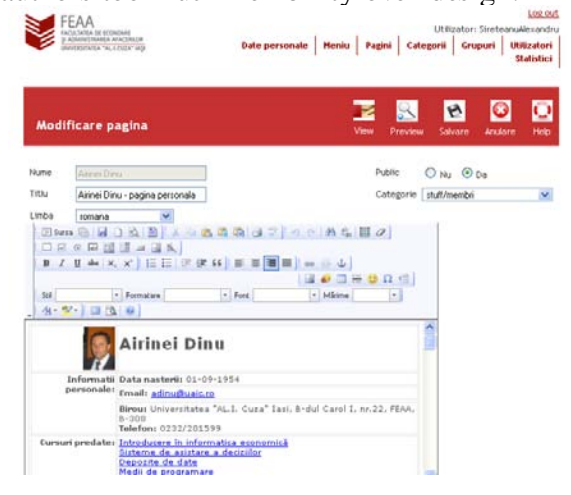
Fig.1. WYSIWYG editor for the academic content of FEAA

An important aspect to be considered when developing a WCM system is to keep the interface usability all the time. Providing a WYSIWYG (what you see is what you get) editor may be the most familiar interface for your users, but it is recommended to not give authors too much flexibility over design.