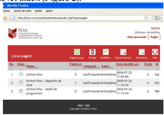
Fig.2. List of pages for an author

the author to build a list of pages, and decide how those pages should be ordered in a onelevel index (Figure 2).